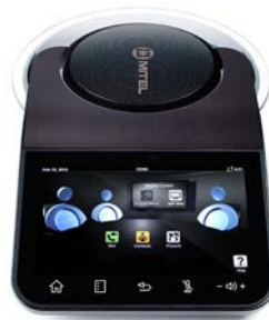
MiVOICE CONFERENCE PHONE