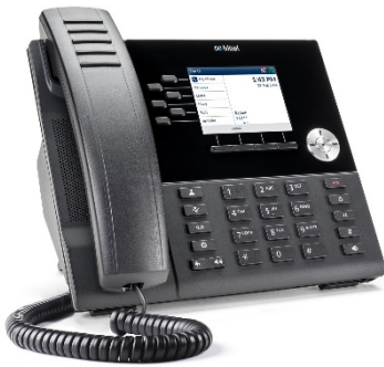
MiVOICE 6920 IP PHONE