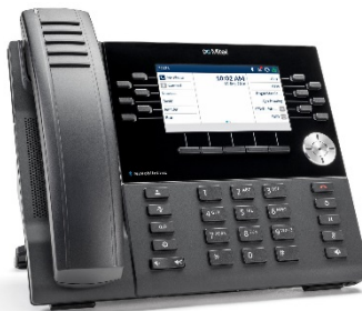
MiVOICE 6930 IP PHONE