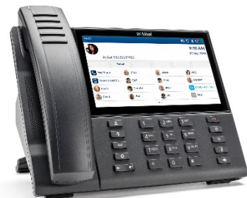
MiVOICE 6940 IP PHONE