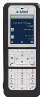
Mitel 600 Series DECT Phones